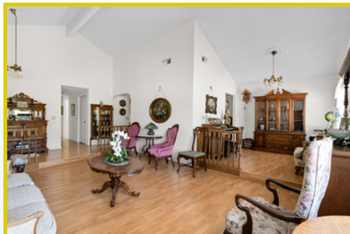
Living Room & Dining Area