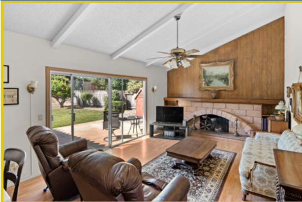
Family Room w/Fireplace

4695 Marlene Dr., Orcutt/Santa Maria, CA 93455